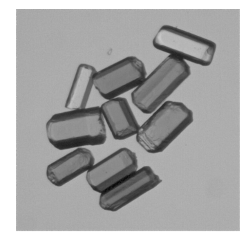
Apatite crystals.

Geologists use knowledge of radioactive decay , the spontaneous transformation of a radioactive element, and the ratio of old to new material left behind from this process to estimate the time of cooling. This practice is known as thermochronology . In particular, they can use the mineral apatite. Apatite contains tiny amounts of the radioactive elements uranium and thorium, which produce helium as they decay. Since the helium is only kept in the rock if it has cooled below roughly 70 °C, the ratio of uranium and thorium (old material) to helium (new material) in the rock can provide the age of cooling.