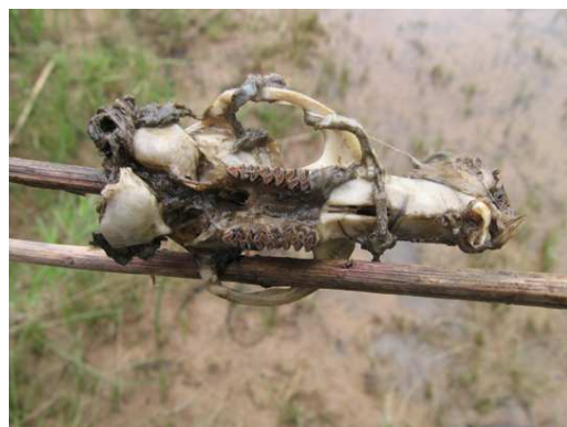
Beaver tracks (right, and right of the shoe print in the picture) were found in our Lower Brown's Park sandbar survey site at river mile 257.8. This muskrat skull (right) was still attached to a dead muskrat at the same survey site.