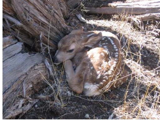
The only presence of a black bear we discovered was this large track (left) at our Red Creek confluence survey site at river mile 278.8. This deer fawn (right) we chanced upon during our Red Creek confluence survey site (species unknown: either mule deer or white-tailed deer).