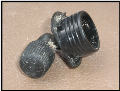
A valve of some kind, perhaps from a raft. Found at the Yampa confluence.

I decided to document recent human use of the Green River corridor by collecting trash found along the way. I was actually surprised by the overall cleanliness of the area given the high use and multitude of access points. Generally, few items were found and those that were tended to be accidental losses of equipment related to river use. There were some strange exceptions, however. Below is a photo essay of some of the more interesting items found during the trip.