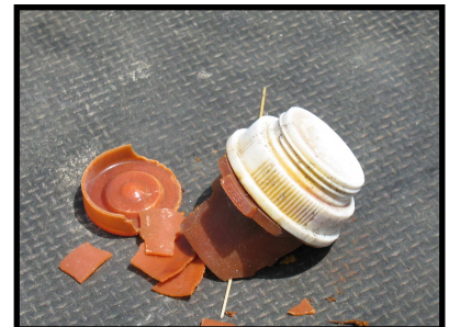
A pill bottle containing a curious staining yellow powder, perhaps iodine. Found at Big Island