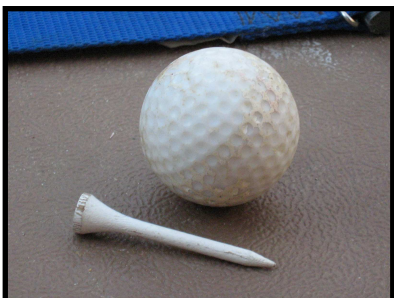
A golf ball and tee. Found at Campsite 2.