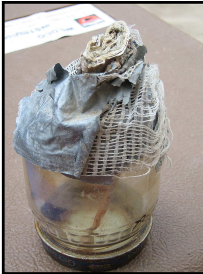
An oil lantern "MacGyvered" from a baby food bottle and some duct tape. Found at the Yampa confluence.