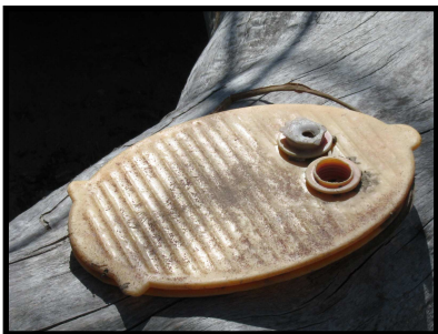
A foot pump, probably used for raft inflation. Found at Sage Creek, by Chris Hammersmark.