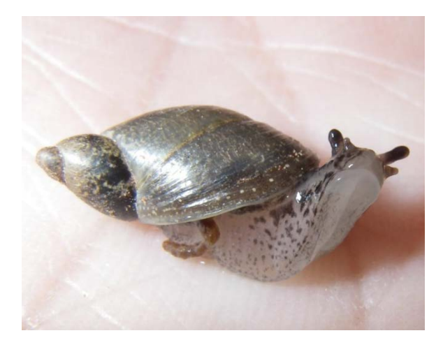
Figure 1: Kanab Ambersnail

of the snail, either by transporting eggs that become stuck on the bird, or by ingesting adult snails and passing them through the digestive system. Snails residing in the Upper Elves Canyon were from a population of 340 snails that were transported by humans from 1998 to 2002 as a conservation measure.