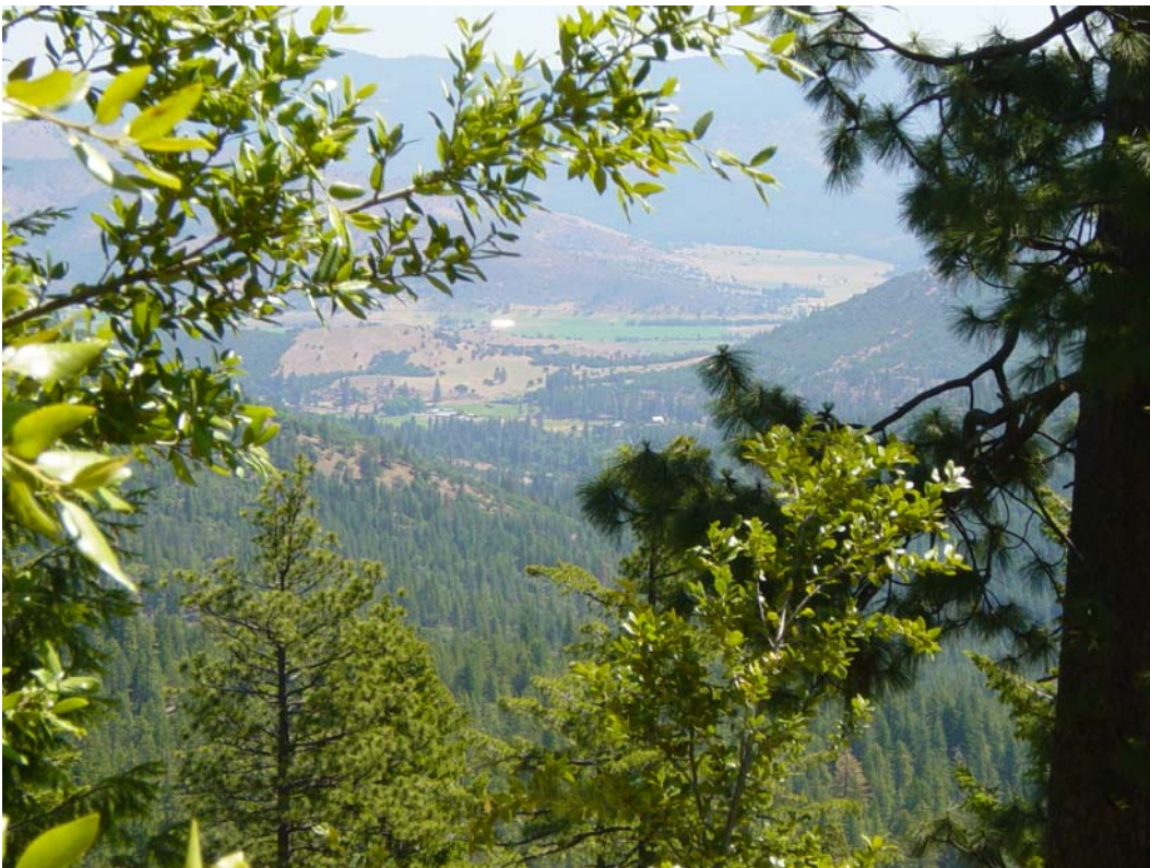
Figure B-12 – Overview of French Creek watershed from USFS Rd 41N14.