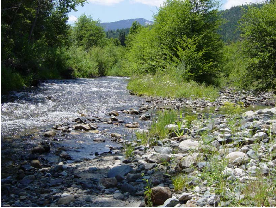
Figure B-3 – Upstream view of downstream end of sub-reach FR02a. Many small fish in pools in river right side channel.