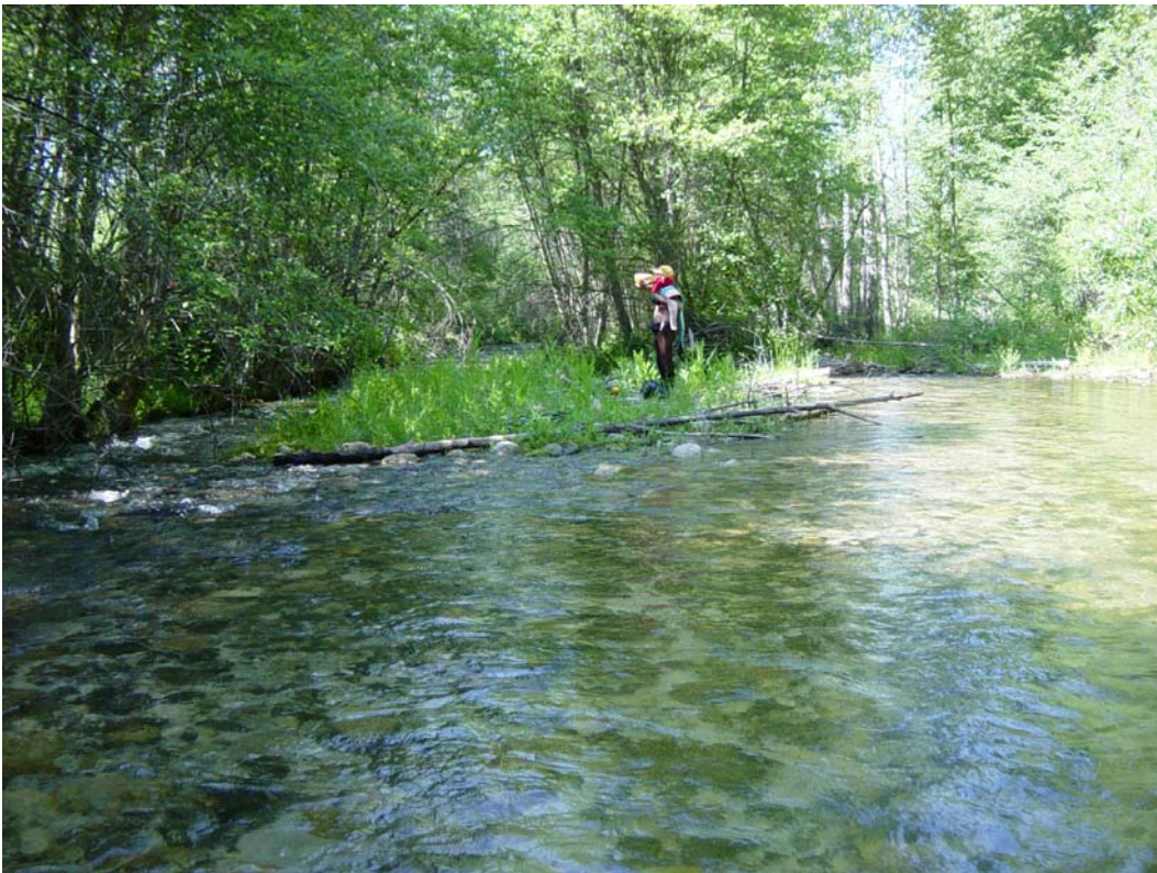
Figure B-4 – Downstream view of upstream end of sub-reach FR02b.