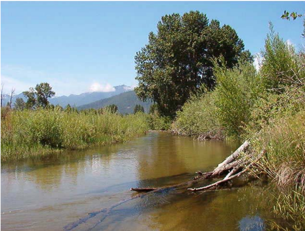
Figure B-1. – Upstream view of FR01. Large woody debris and pool upstream provide good fish habitat.