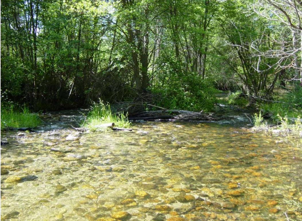
Figure B-5 – Downstream view of mid-channel bar in sub-reach FR02b.