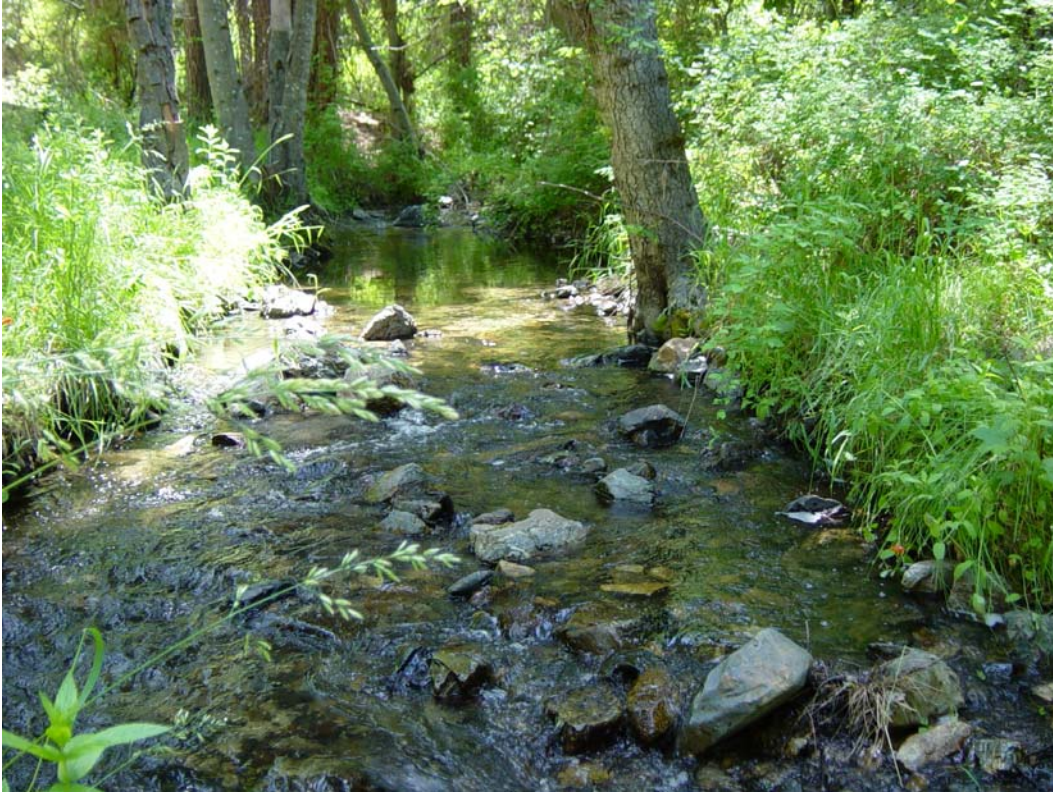
Figure B-11 – Upstream view of upper portion of Miners Creek.