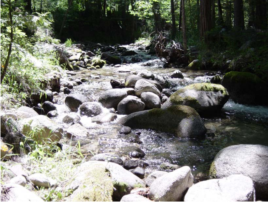
Figure B-9 – Upstream view of lower portion of reach FR04.