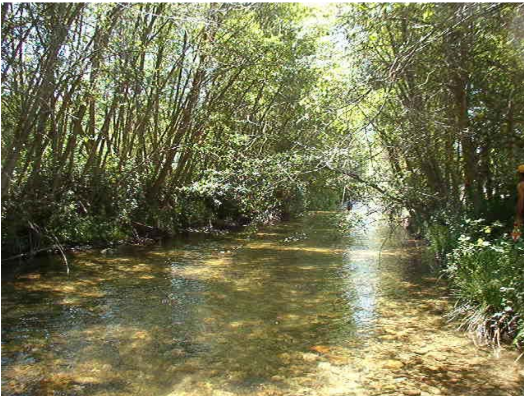
Figure B-6 – Upstream view of FR03.