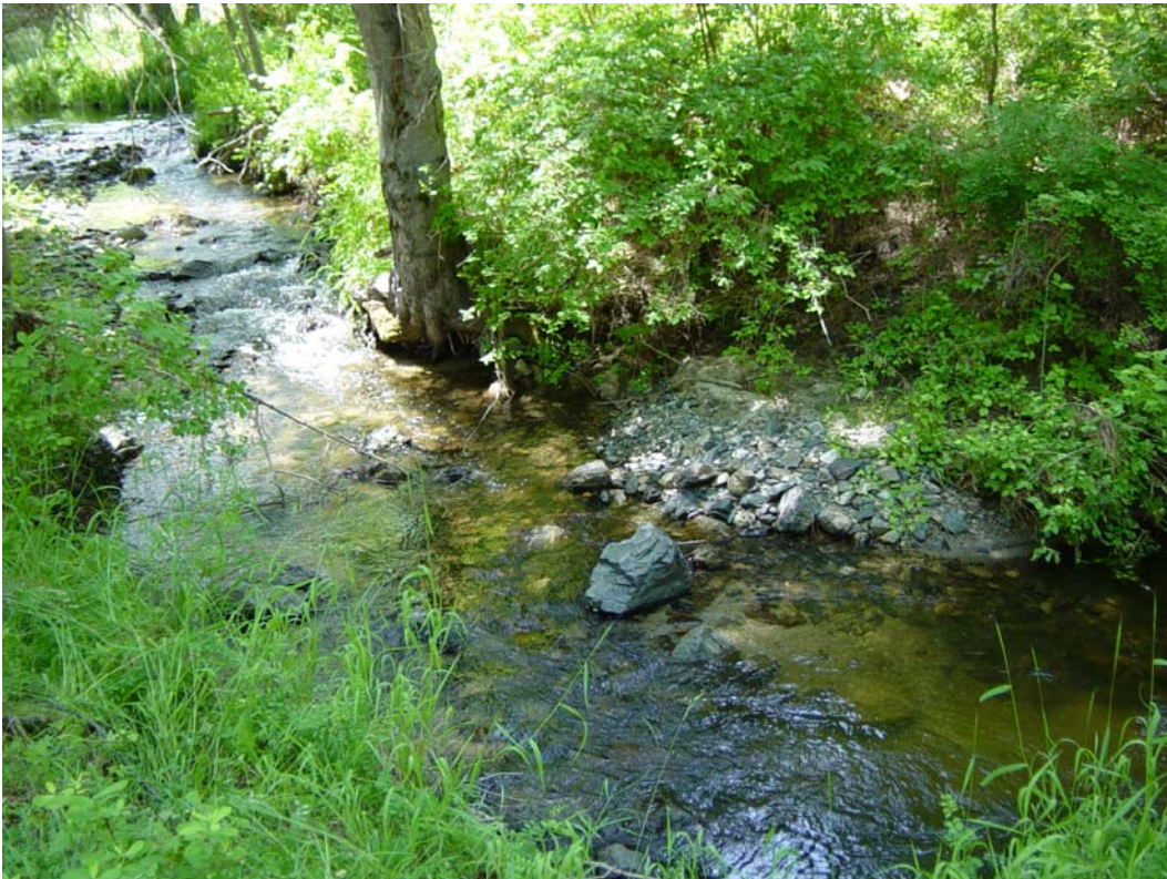
Figure B-10 – Overview of lower portion of Miners Creek.