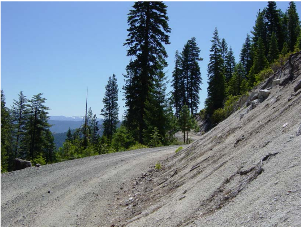
Figure B-14 – Exposed road cut (USFS Rd 41N14) through decomposed granite in headwaters of French Creek.