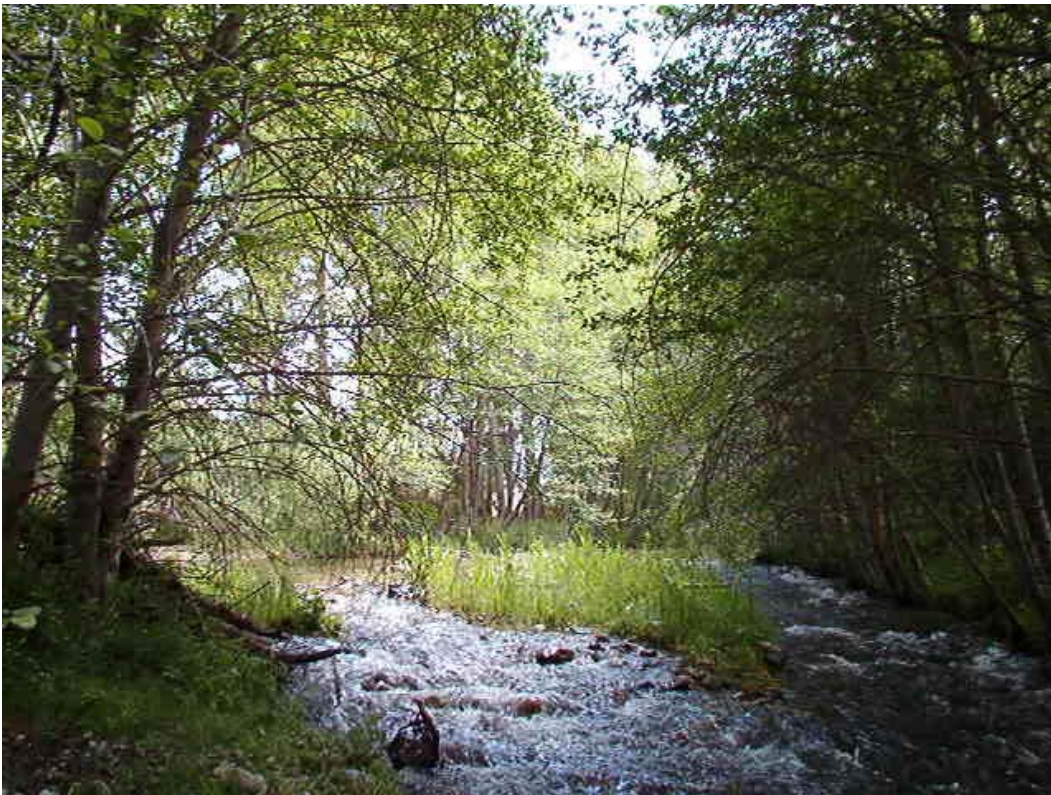
Figure B-2 – Upstream view of downstream end of FR02.