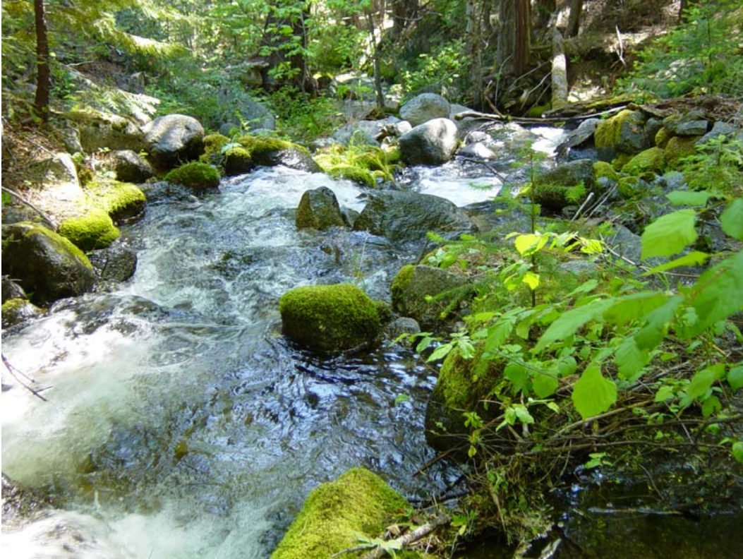
Figure B-13 – Downstream view of Duke Lake Creek, tributary to French Creek, from USFS Rd 41N14.