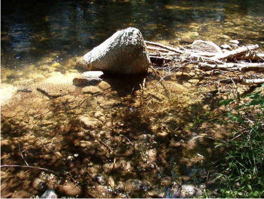
Figure B-7 – Suitable fish cover in reach FR03.