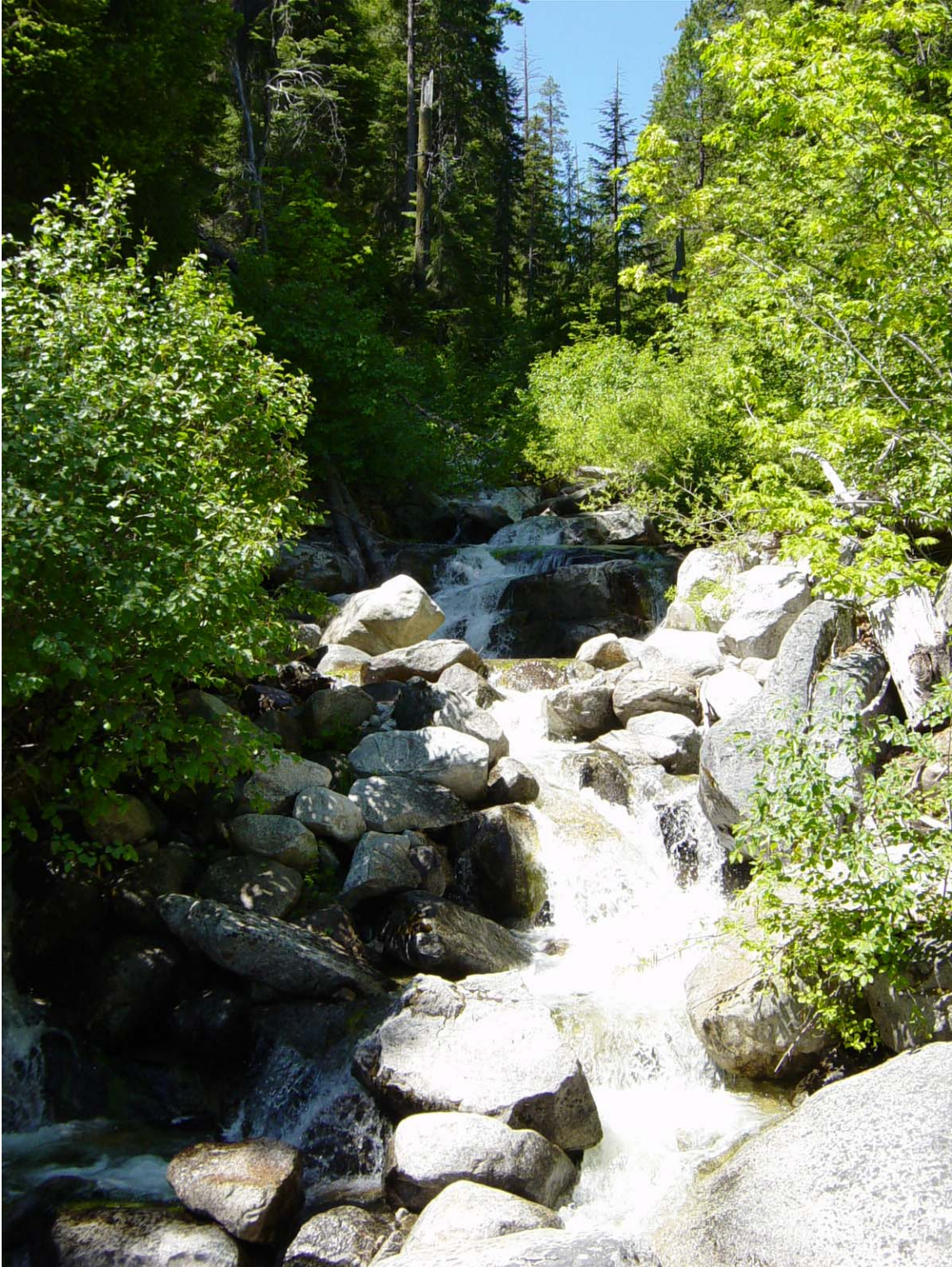
Figure B-15 – Upstream view of Paynes Lake Creek, tributary to French Creek, from USFS Rd 41N14.