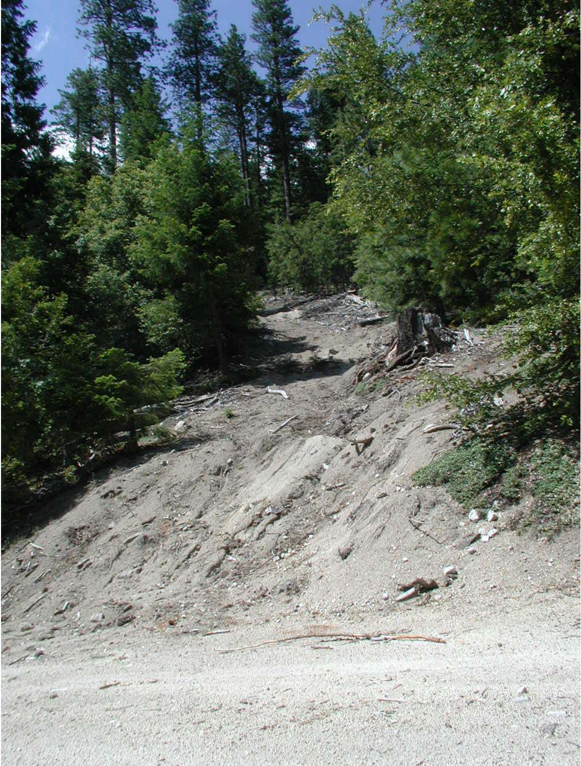
Figure B-16 – Heavy erosion onto USFS Rd 41N14 from logging skid trail cut through decomposed granite in upper French Creek watershed.